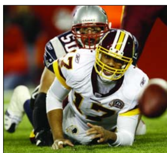
Patriots linebacker Mike Vrabel forces a fumble from Redskins QB Jason Campbell on Sunday.