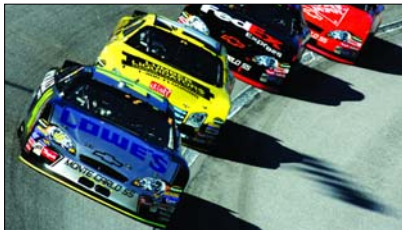
Jimmie Johnson (48) took only two tires to win in Atlanta.

Will donate winnings to wildfire victims