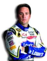
Full results and notes from the Pep Boys 500 Page D3

"I just think it's going to be a fight to the end," Johnson said. "We took a good bite out of Jeff's points lead today and it's going to come down to a position or two in the next three. Please see ATLANTA, Page D3